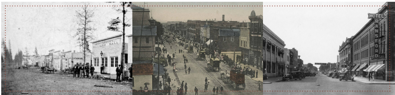
Brainerd, Minnesota, in 1870, 1894, and 1930s. Incrementally growing up, step by step.

With each step in this cycle, private wealth increases the capacity of the community. That capacity was tapped to improve public services, whether it was paved streets, improved drinking water and sanitation,